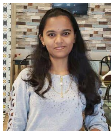
R.ROHONI (DISPATCH TRACK SOFTWARE PVT. LTD.)