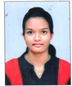
ANJANA (INTENSE TECHNOLOGIES LIMITED)